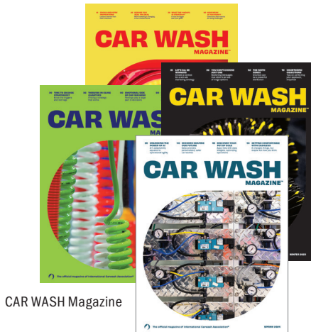
CAR WASH Magazine

The Best of 2024 will feature targeted distribution at The Car Wash Show 2025 and will be the ONLY issue of CAR WASH Magazine available at The Show in print. Its circulation will include a digital version that will be distributed to a targeted email list of more than 20,000 professionals in the car wash industry, including all registered attendees at The Car Wash Show.