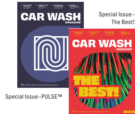
Special Issue- The Best!